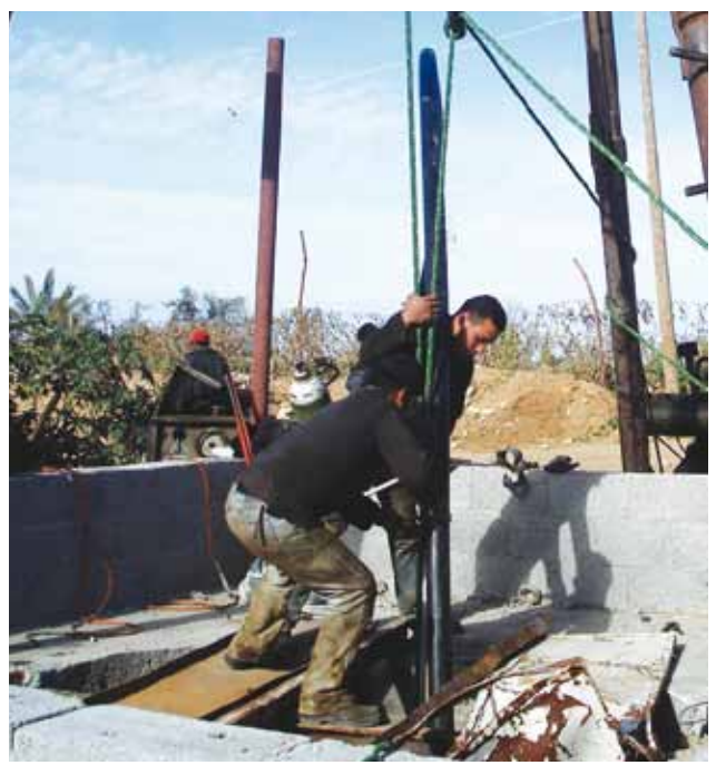
In the process of rehabilitating one of the wells.

The rehabilitation process included: disposing