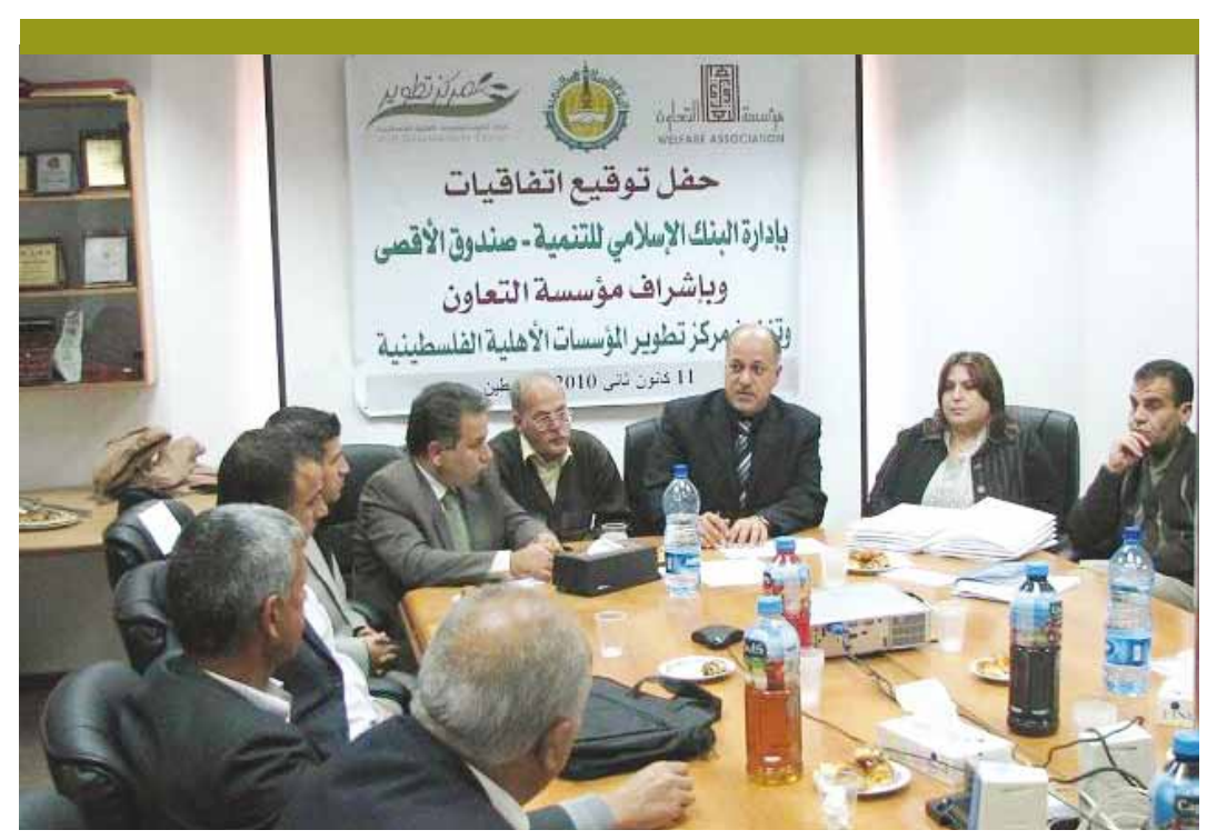
Side of the ceremony.