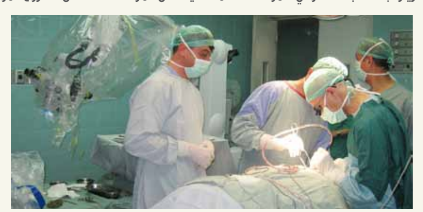
Visit to St. Lukas Hospital in Nablus