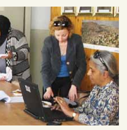
خلال زيارة البعثة لاتحاد الجمعيات الخيرية فى نابا