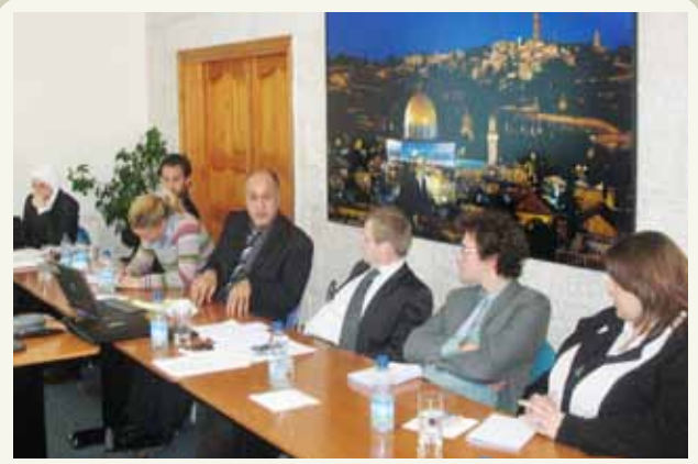
۱۸ اذار ۲۰۱۰ – مركز تطوير يجتمع مع مجموعة من الممولين لمناقشة سبل التعاون.

18 March 2010 -Children from Kufr Naama visit NDC to extend their gratitude for its support to Kufr Naama children's club.