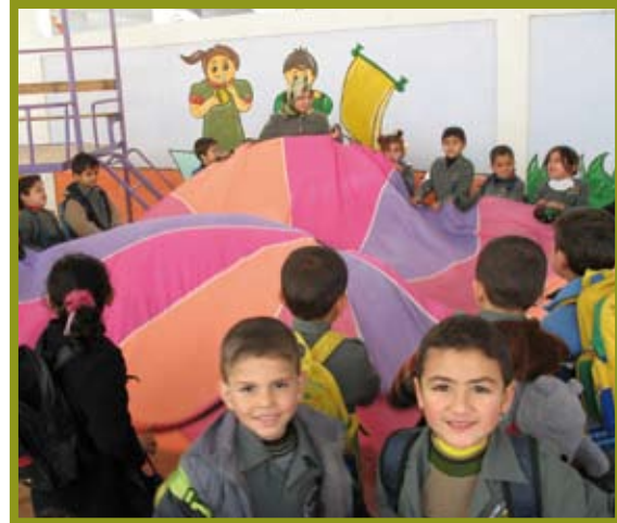
Rehabilitation and development of Palestinian Home Society, Gaza, AFD Project

A: The main success is building a solid infrastructure which improved the living conditions of Gaza's population. In addition, the centers and buildings we built are operational