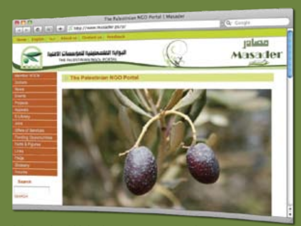
Masader Website: www.masader.ps

Established by the NGO Development Center (NDC), the Palestinian NGO Portal (Masader) is the first and unprecedented NGO Portal in Palestine and in the Arab world. Masader specializes in serving and empowering the NGO sector in terms of assisting NGOs in overcoming geographic limitations and providing them with opportunities for communicating amongst each other and among other relevant parties. Through Masader, member NGOs are able to publish and exchange their achievements (e.g. projects, studies, research, proposals, administrative and financial reports, etc.). Moreover, Masader exists as a current and concise resource for governmental, private, academic, and media institutions; assisting them to operate with a higher level of accuracy and professionalism. Finally, Masader provides donors, whether individuals or institutions, with the needed information in making funding decisions.